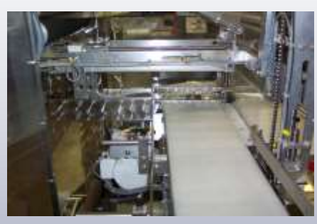
Rod-less transfer pusher, fully adjustable accumulation area and smooth product transfers