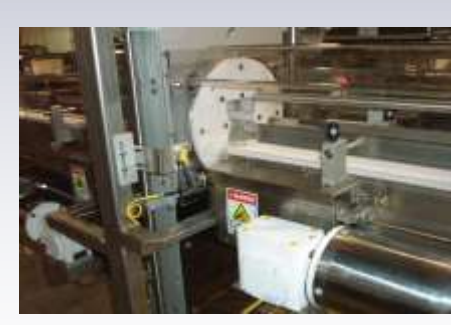
PI-2006 Product Inverter