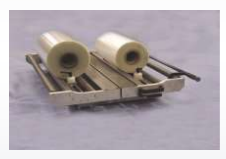
Easy load film racks