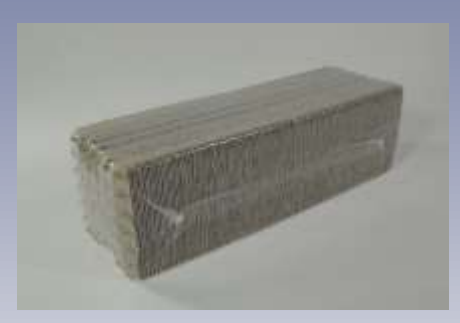
Total film enclosure available