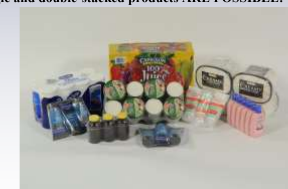
Samples of actual products run on APM Machinery equipment